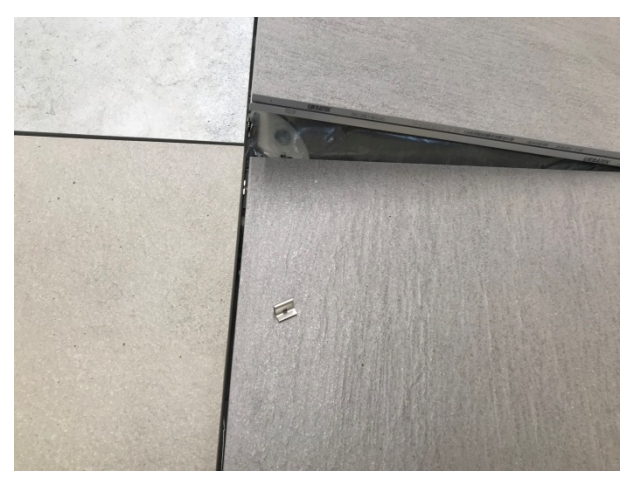
Close-up of detachment

The results given refer exclusively to the test sample itself and are only valid under the same conditions in which testing was carried out.