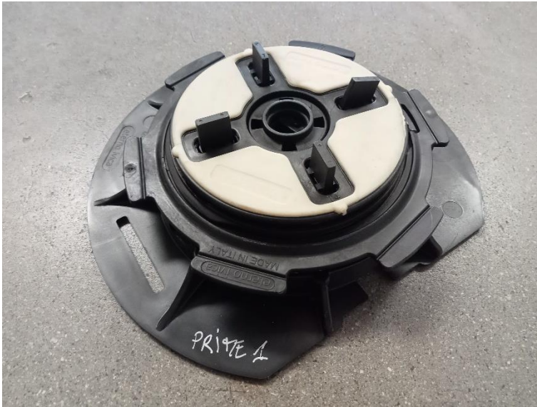
Sample at the end of the test